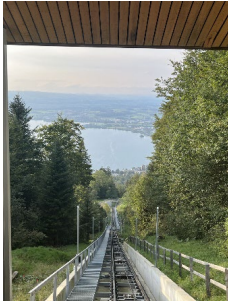
📌 Cable car to Zugerberg