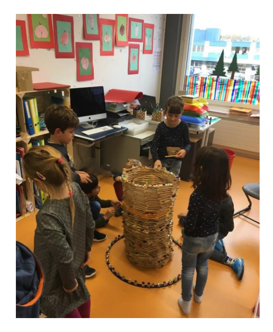
Observed and interacted with the year one maths class. This was using the method of more play based learning. Here the students are creating a tour first with the blocks then using gem stones as decorations.