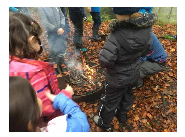
This photo was taken while out in the forest with the students. The classroom teacher was making a fire and the children were watching and keeping warm. It was fantastic to see how the students respected the teacher's instructions in the importance of being safe around a fire.