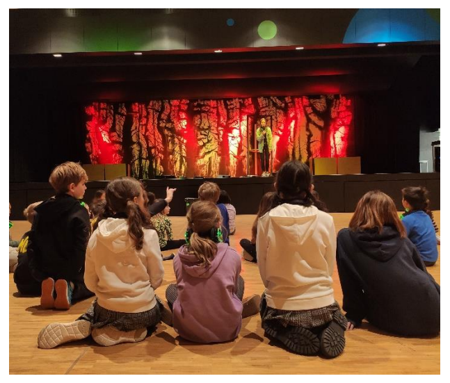
An example of the resources used from the PH Zug