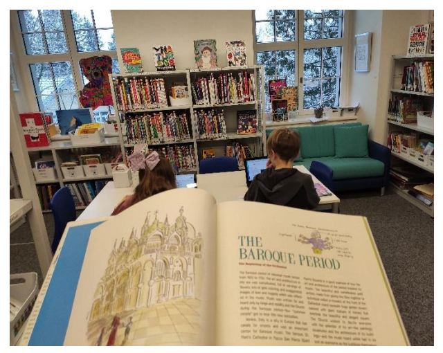
Some of the resources I could count with during my intern