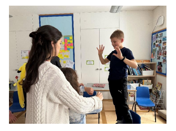
With the children at the library